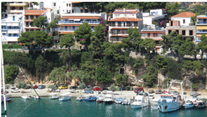
Liadromia (brown shutters centre right) & Nina's (blue shutters centre left)

The Studios: Self Catering Studios for 2/3 Air Conditioning Free Wifi