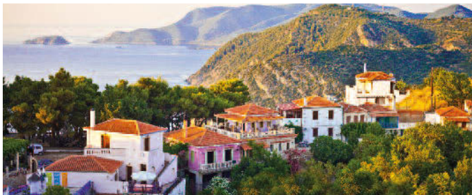
Alonissos Old Town