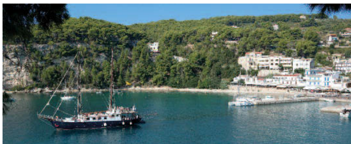
Patitiri view from near Nina's and Liadromia

The Studios: Self Catering Studios for 2/3 Air Conditioning Free WiFi