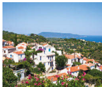
Alonissos Old Town

Patitiri port is 3 kms away by road and linked by bus (seasonal mid-Jun to mid-Sep)- for walkers there is a footpath which takes around 30 mins. - and it's 1500m to Megalo Mourtero beach reached by a steep path. Car hire is recommended for non walkers.